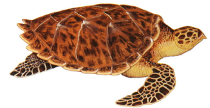
Hawksbill Sea Turtle

Both Lloyd Beach State Park and the Ft. Lauderdale Discovery Science Museum offer night time turtle walks beginning in June. Call today to reserve your space as these are highly attended meets. Nova University offers training for those interested in becoming Scouts for turtle hatchlings, assisting disoriented baby sea turtles make it to the Ocean. If you missed this season, we need your help next season. These marvelous and ancient creatures are all endangered species!